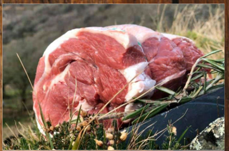
Herdwick Lamb available -Please call for more details